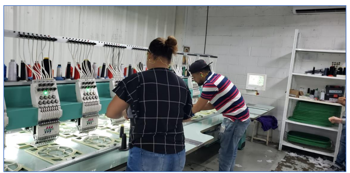
Figure 8: Workers equipped with ear plugs. (Figure provided by RJ Torres, August 2022)

during work." They report having provided free ear plugs to operators, though they did not state whether ear plugs were made available to employees in loud areas outside of the embroidery room. The management provided documentation of their quotation request for all employees to undergo annual audiometric testing. Finally, they note that they have reduced the volume of music in the factory (which was not among the recommendations provided by the WRC).