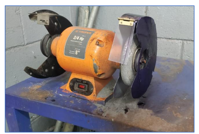
Figure 10: Tool grinder with shield protector installed.

The WRC reiterates the recommendation that, in addition to the shield protector, RJ Torres should install a tool rest for the tool grinder. The gap between the grinding wheel and the tool rest should be no wider than 1/8 inches to prevent the item being sharpened from getting caught in the gap and possibly causing injury or shattering the wheel.