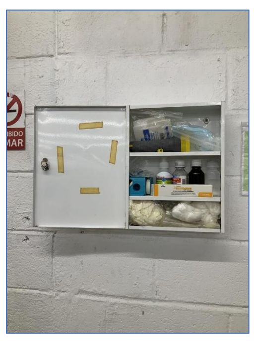
Figure 14: First aid station

The WRC's inspection of RJ Torres found that, while there are three first aid kits on the first floor of the factory and two on the second floor, they were not appropriately stocked. The kits did not have mouth guards to use during mouth-to-mouth resuscitation. Only latex gloves were provided, which can be allergenic to some individuals. Several items from the kits' supply list were missing or were not kept in sterile packaging. The acetaminophen bottle in one kit was expired. However, the factory's first aid inspection