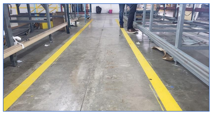
Figure 5: Repainted aisle strips. (Figure provided by RJ Torres, August 2022)

RJ Torres also cites a certification from the Dominican Fire Department in April 2022 stating that the factory has an adequate evacuation system and can be evacuated in approximately two minutes. The factory has yet to agree to the WRC's recommendation that it replace the sliding door to the component room with a swinging door.