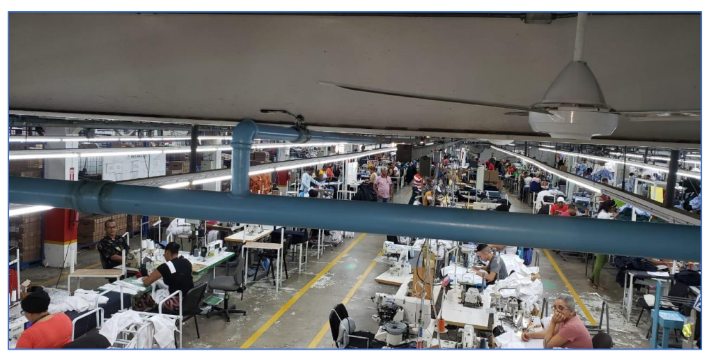
Figure 7: Dust on overhead pipes was removed. The factory has purchased four vacuum units for regular cleaning.

RJ Torres responded to the WRC's recommendations in August 2022 by reporting they have removed combustible dust build-up from overhead pipes and building supports and closed electrical junctions to prevent dust intrusion. They have added four industrial vacuum units to conduct a basic cleaning daily and deep cleaning monthly, to manage lint and dust. Management reported that it had evaluated the storage area for boxes and fabric boxes to ensure these were not located near heat or electrical installations. RJ Torres management stated that it had re-inspected all fire extinguishers and retrained its management team to conduct these inspections.