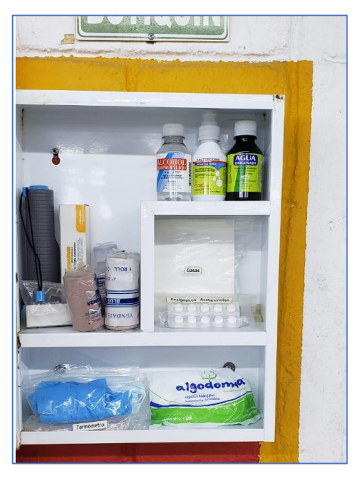
Figure 15: First aid station, with replenished supplies and labels.

Dominican regulations require that employers inform workers about health and safety risks on the job,