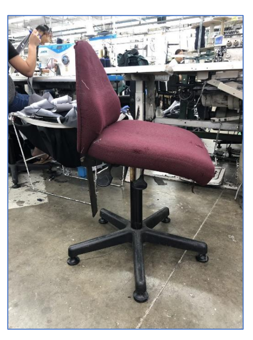
Figure 13: Chairs are in poor condition and are not ergonomically appropriate