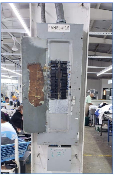
Figures 1 and 2: Combustible tape on electrical panels has been replaced with metal coverings. (Figure 2 provided by RJ Torres, August 2022)