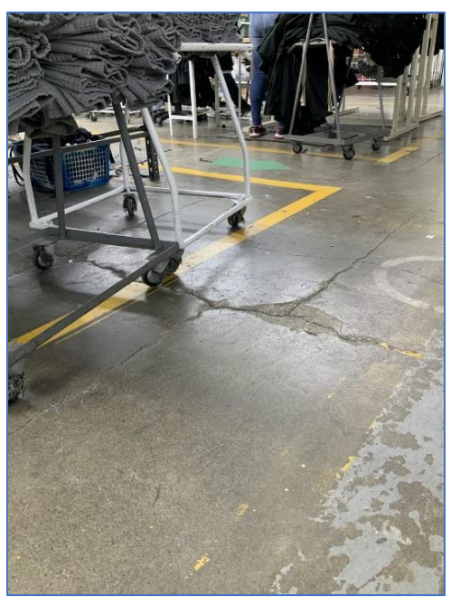
Figure 15: Cracked floor surfaces

RJ Torres stated that managers have requested floor repairs from the factory's lessor.