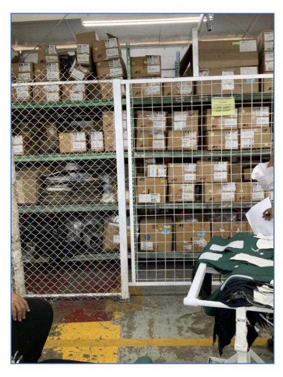
Figure 6: Combustible materials stored in the factory building

The facility had 90 fire extinguishers ("FEs"). A random inspection of six of these FEs found that 50% had deficiencies. The monthly inspection tags