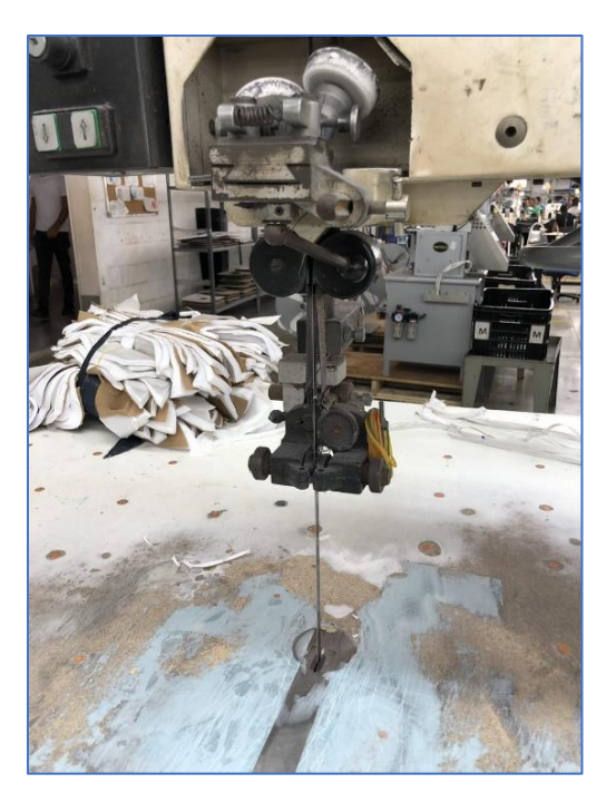
Figure 9: Fabric cutting machines missing blade guard