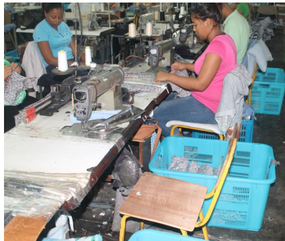
Figure 1: Non-Ergonomic Unpadded Seating

The WRC’s health and safety specialist examined the chairs upon which the factory’s sewing machine operators sit ( See Figure 1 ) and found that they are