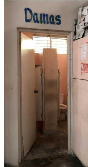
Figure 7: Insufficient Women's Toilets

Moreover, while on the day of the WRC's inspection of the factory the toilets were adequately stocked and maintained, some employees interviewed by the WRC reported that the restrooms are frequently unclean and lacking soap or paper towels.