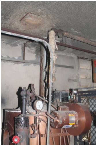
Figure 6: Boiler with Possible Asbestos-bearing Insulation

While, since the 2013 inspection, the factory has removed thermal insulation material – which potentially contains asbestos – from the top of the factory’s boiler system, the outlet pipe from the boiler is still wrapped in the same material. (See Figure 6) The WRC’s safety and health specialist found no evidence that the factory has ever tested the insulation material to determine whether it contains asbestos. Therefore, the same potential hazard and violation of safety standards still exists. 43