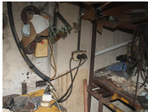
Figure 4: Unsafe Electrical Wiring in Maintenance Shop

However, the safety and health specialist also noted that a significant number of other electrical hazards that violate Dominican safety regulations 41 were still present in the plant. First, the factory’s maintenance shop continues to lack a fiberglass (i.e., non-conductive) ladder for mechanics to use when doing work with or in proximity to energized ceiling lighting. 42 Moreover, inside the maintenance shop, itself, an electrical outlet runs through the junction box with metal-on-metal, and there is an electrical conduit which is broken with exposed conductors inside. (See Figure 4)