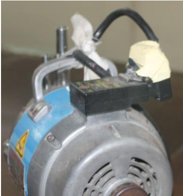
Figure 5: Spliced and Inadequately Protected Wiring on Cutting Equipment

The WRC recommends that SMC take the following measures to remedy and prevent violations of Dominican labor law and the Ordinance with respect to electrical hazards: