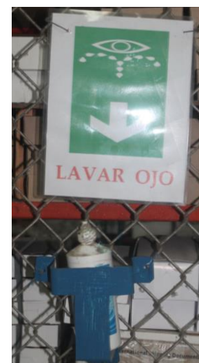
Figure 3: Inadequate Eyewash Station

In addition, contrary to accepted safety standards, 39 the factory does not provide adequate eyewash facilities in case of exposure to acid solutions that are used in the factory’s generator room for recharging batteries. The nearest eyewash equipment to the generator room is a bottle of eye rinse solution which is kept in the factory’s maintenance shop, which cannot be accessed from the generator room within ten seconds and thereby fails to meet safety standards. Finally, the bottle of eye rinse solution holds only sixteen