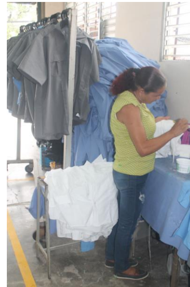
Figure 2: Standing Work on Bare Concrete Floor