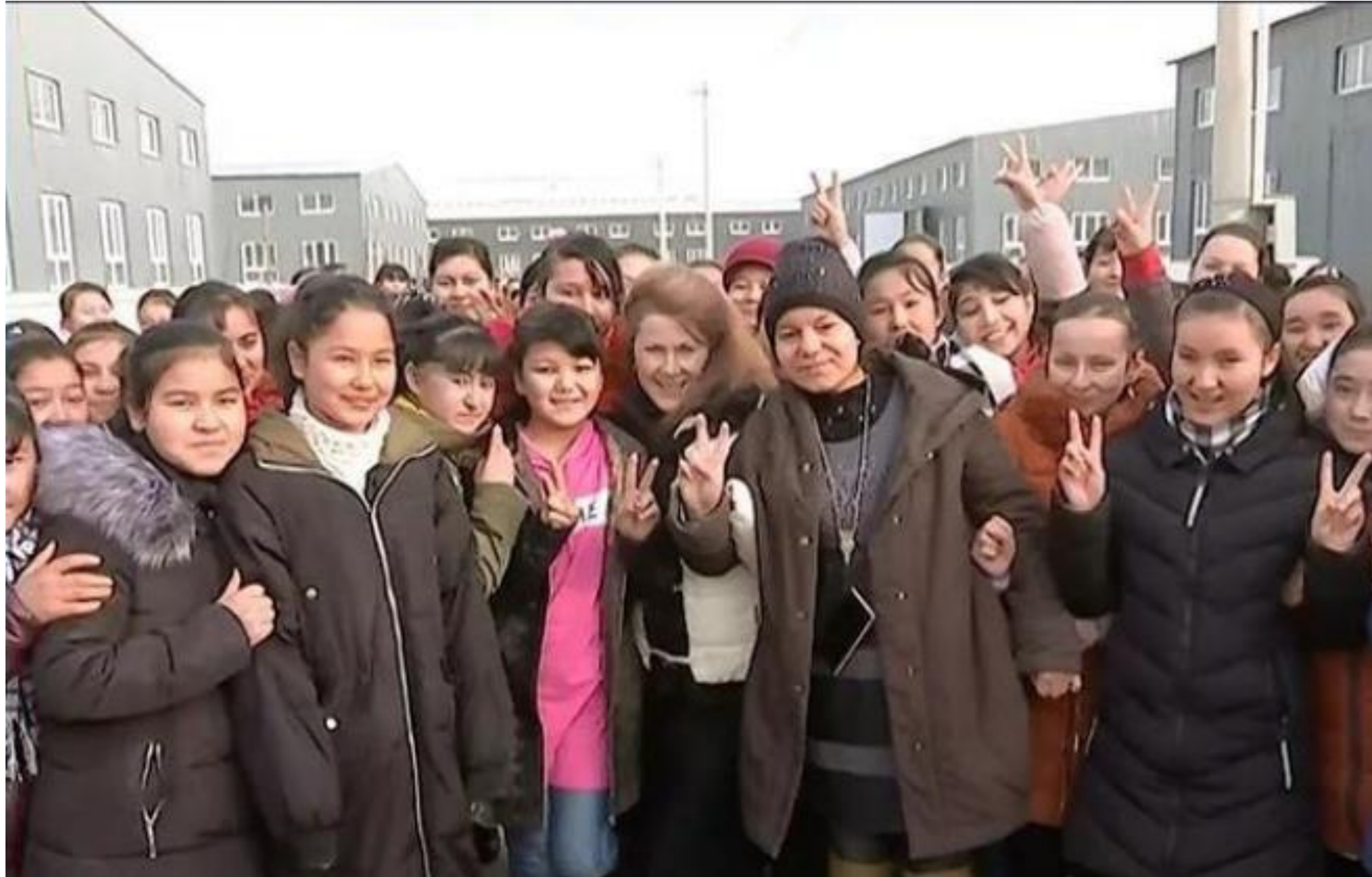
Photo of Badger Executive at Hetian Taida