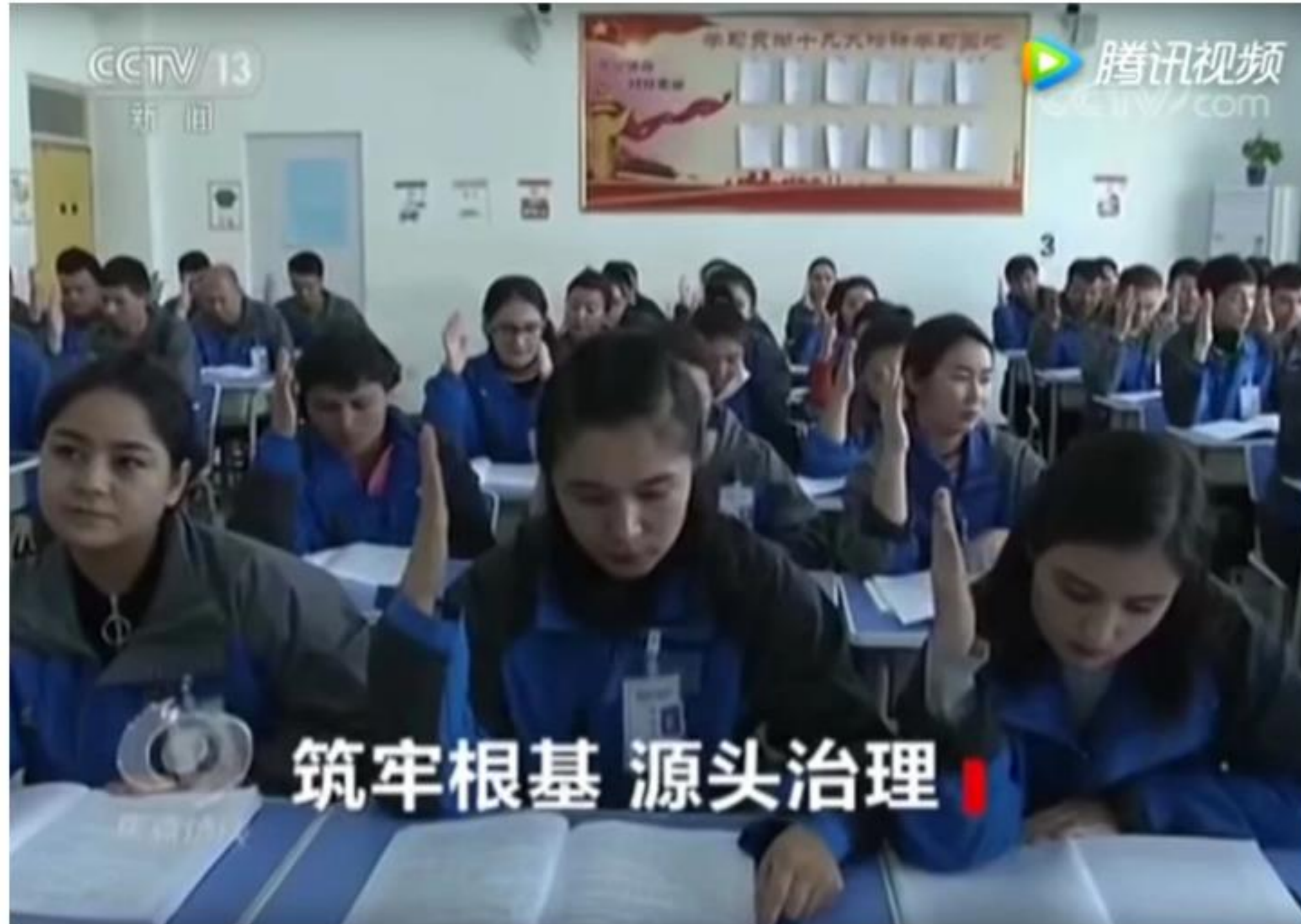
Chinese state television showed Muslims attending classes on how to be law-abiding citizens. Evidence is emerging that detainees are also being forced to take jobs in new factories.