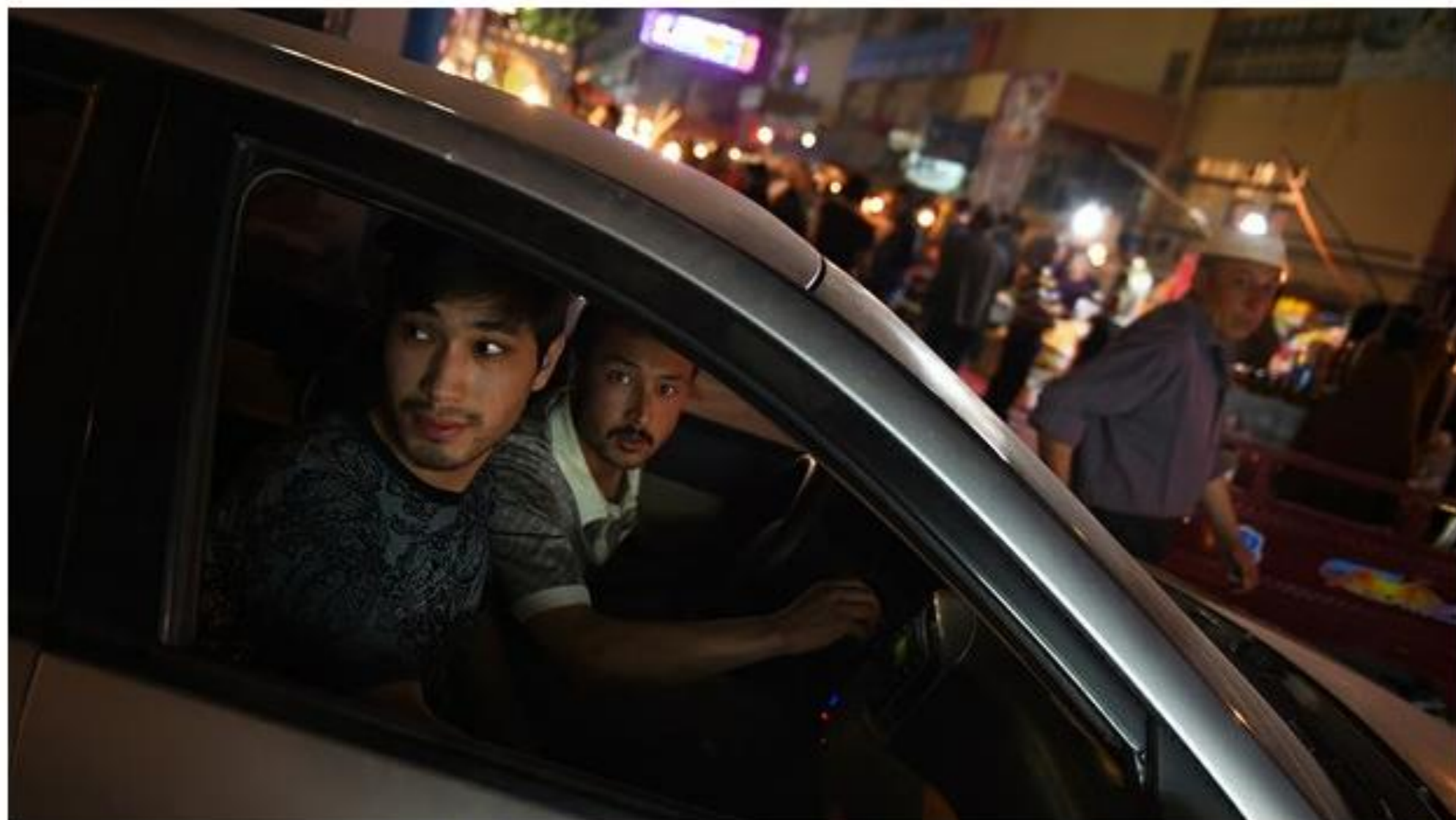
Young Uyghur men drive a car through a night market in Hotan, in China's Xinjiang region, April 15, 2015.