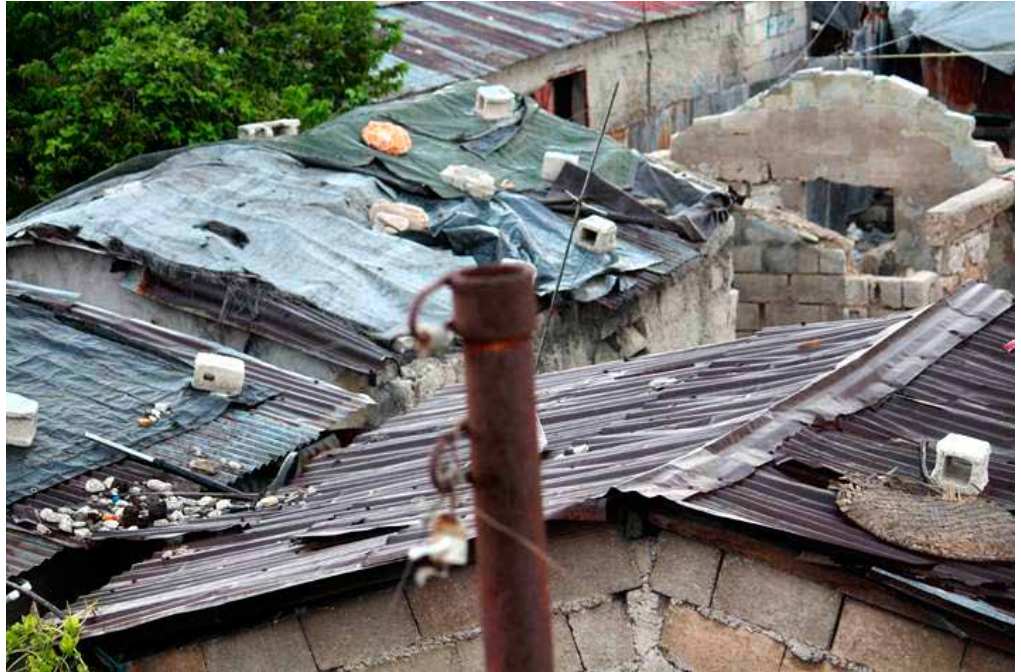
Earthquake damaged dwellings with tarp-covered roofs in the Cite Soleil slums of Port-au-Prince

Workers reported that the conditions of the housing they can afford is poor with no running water and varying degrees of access to erratic electricity, and often in neighborhoods that are unsafe. For example, Cite de Soleil, a district of Port-au-Prince where garment workers live has been described as “one of the hemisphere’s most miserable slums.” 74 Some workers stated that after the 2010 earthquake they were unable to afford to move or rent new shelter and that they continue to live in homes that were seriously damaged.