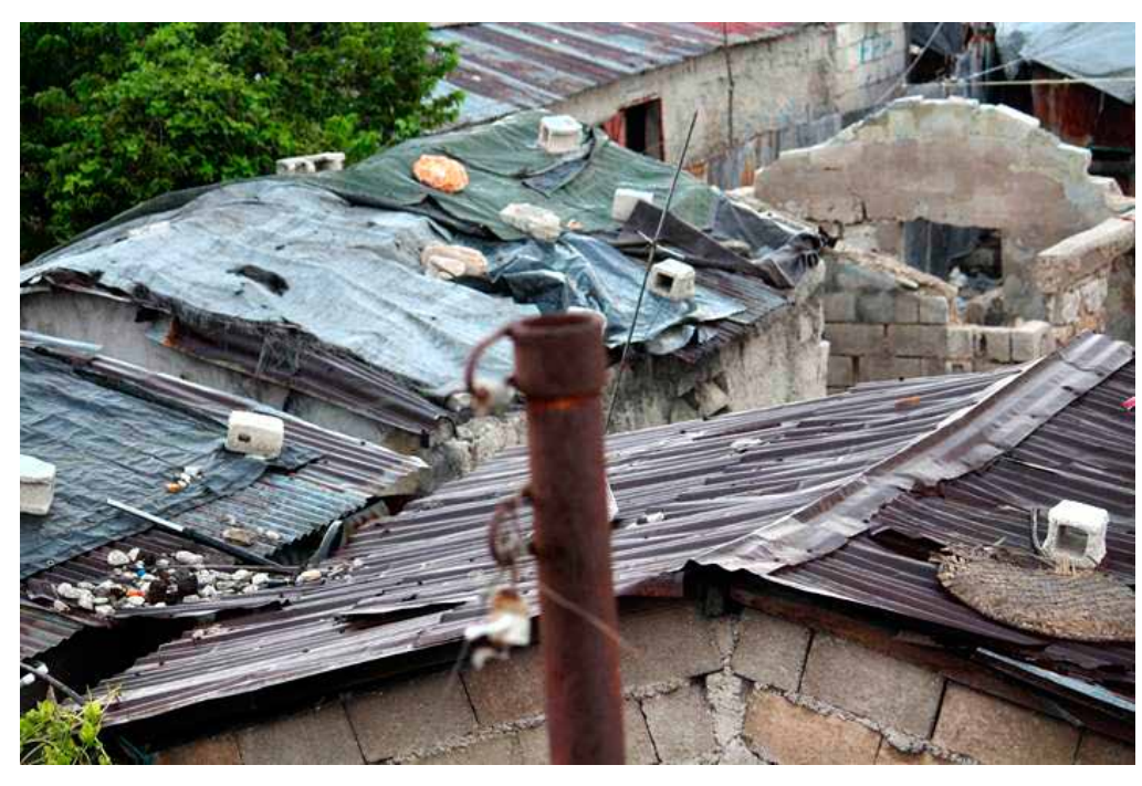
Earthquake damaged dwellings with tarp-covered roofs in the Cite Soleil slums of Port-au-Prince

Workers reported that the conditions of the housing they can afford is poor with no running water and varying degrees of access to erratic electricity, and often in neighborhoods that are unsafe. For example, Cite de Soleil, a district of Port-au-Prince where garment workers live has been described as "one of the hemisphere's most miserable slums."74 Some workers stated that after the 2010 earthquake they were unable to afford to move or rent new shelter and that they continue to live in homes that were seriously damaged.