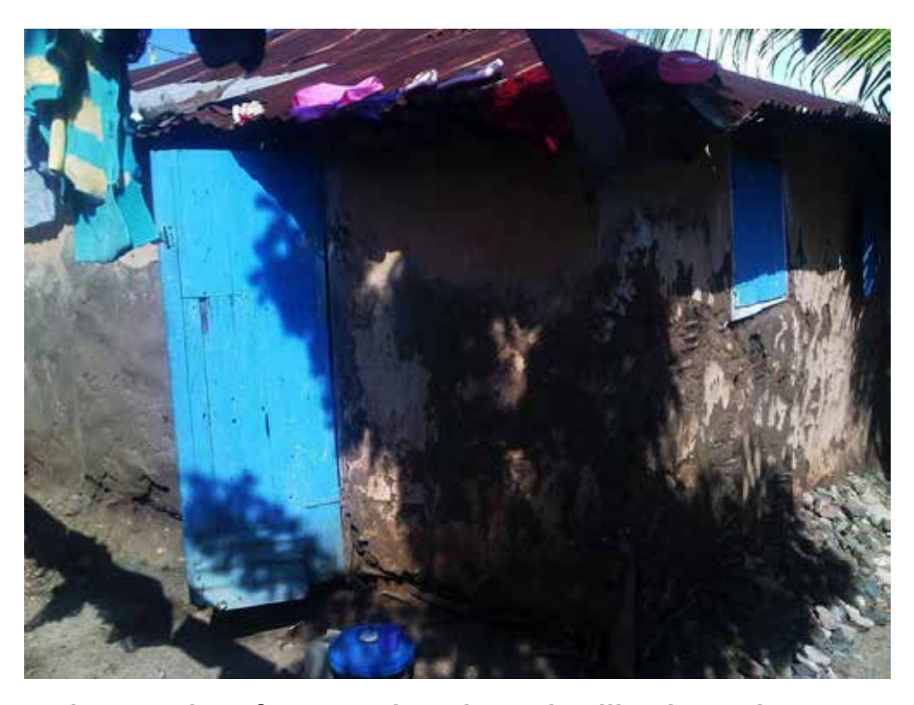
The exterior of a Caracol worker's dwelling in Terrier Rouge

Since October 1, 2012, when the final increase in the minimum wage that the law mandates took effect, the minimum wage for production and piece rate workers has been 300 HTG per day ($6.97), and the lower minimum wage for trainees, job transferees and non-piece rate workers has been 200 HTG per day ($4.64). The Better Work program and the CTMO-HOPE Commission have made clear that for workers who have been working in their current positions for three months or longer, piece rates or production